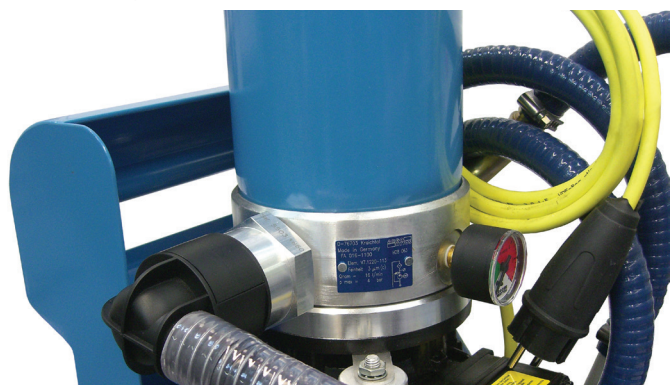
FA 016 with screwed-in suction strainer set FA 016.1775