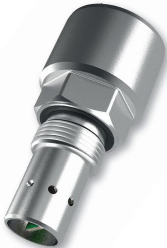
LubCos H 2 O