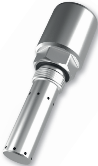
LubCos H 2 O+ II